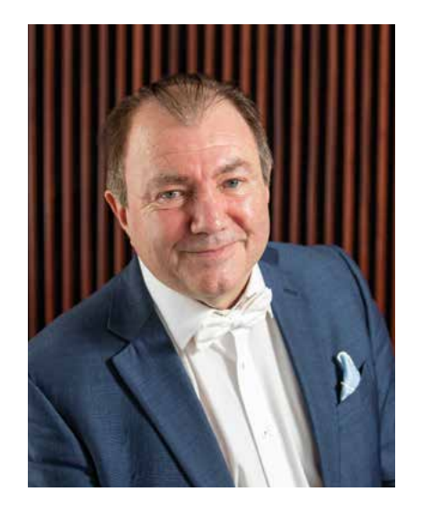
Congratulations and best wishes for the future.

My career was very much founded on my education, as a basis for continuing to learn, and I hope yours will be too. No one can predict the future, what is going to happen to the economy or to the planet, but the skills and the knowledge with which you have graduated will help you navigate life and your career with confidence.