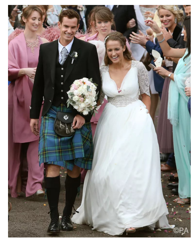
Wedding slammer?

If he is to fulfil his potential as a player, starting with the French Open, his team need to systematically address and eliminate the areas of weakness in his game. These are less critical against players of lower ranking: Murray has the technique and fitness to consistently dominate, hence his position in the world's top three. Against Federer, Nadal and