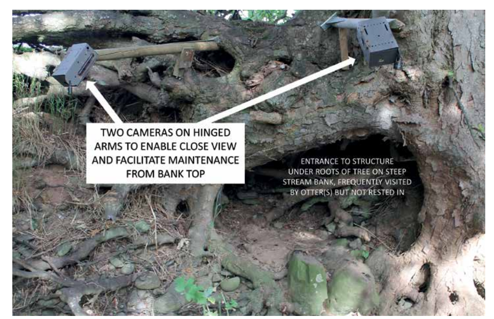
Set up to elevate cameras from water levels during spates. Copyright CC-BY-4.0.