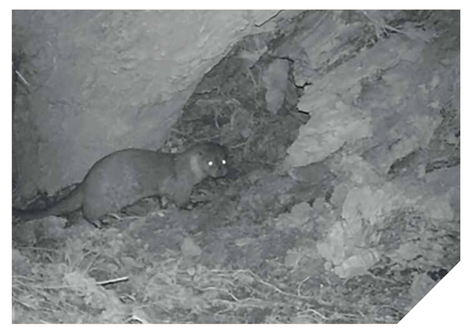
Image from video of otter visiting a resting site.

Keywords: breeding places, EC Habitats Directive, Eurasian otters, passive-infrared sensors, protected species