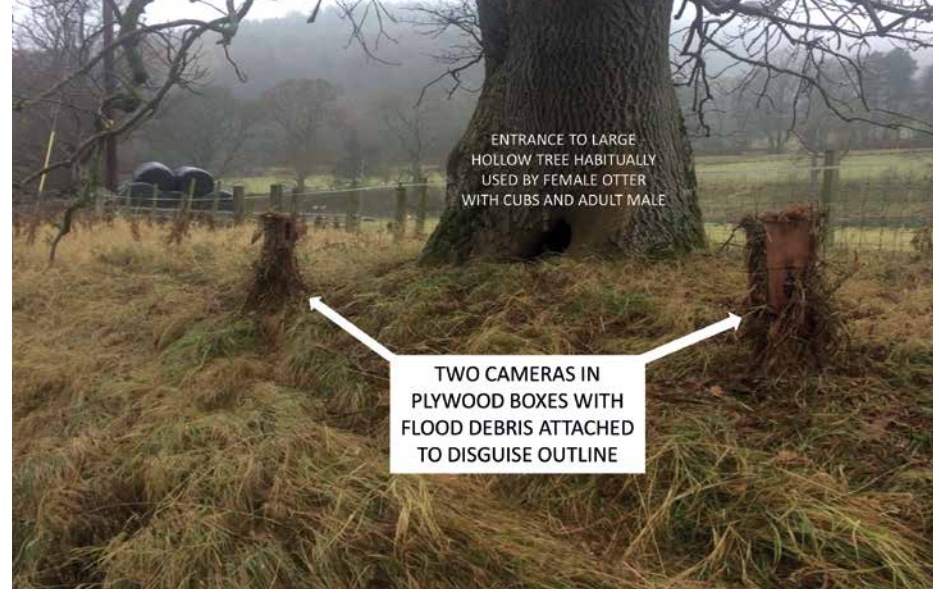
Concealed camera-traps monitoring an otter holt.

False negatives are possible at the scale of the whole survey, i.e. whether a structure is