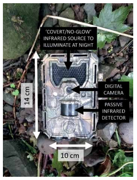
Bushnell Trophy Aggressor camera trap.

determine if the structure was a natal or breeding holt, but it also presented an opportunity to assess our camera trapping set-up. One of our objectives was to optimise camera set-up for data quality while recognising constraints on time and resources. Given a known breeding and resting place, could we have monitored the site less intensely (e.g. fewer cameras, shorter study duration, shorter video clips, setting a 'duty time' to reduce