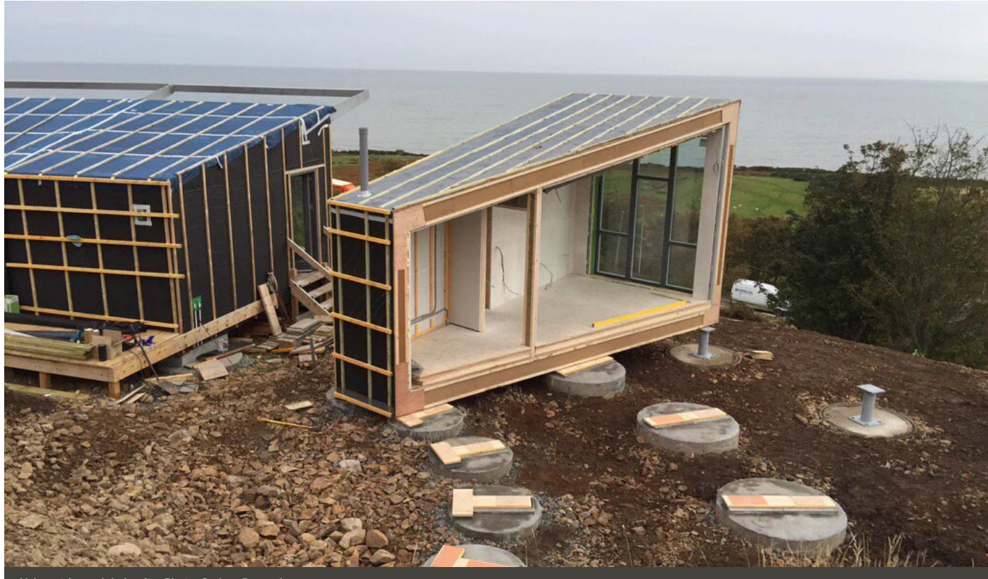
Volumetric module in-situ.

The vast majority of CLT projects undertaken to date in the UK have been in the south of England, with almost 50% of these being in the London region. However, CLT is imported to the UK from mainland Europe, primarily Austria and Germany, where production is reported to be increasing at a rate of at least 20% year on year. Worldwide, facilities now exist in North American, Russia and New Zealand and projections suggest that production of CLT will have increased to approximately 500,000 m3 by the end of 2015. >>