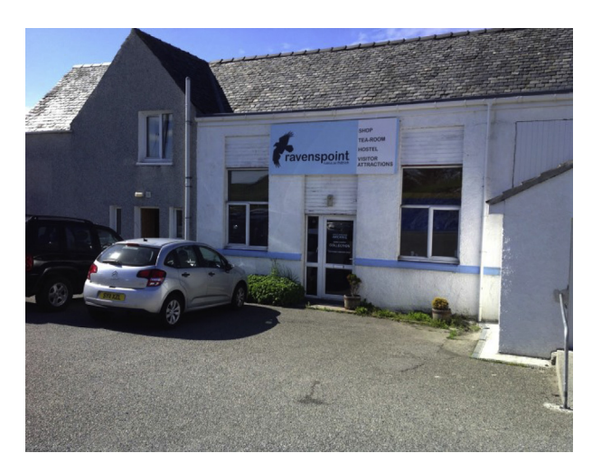
Fig. 2. Ravenspoint, Lewis.