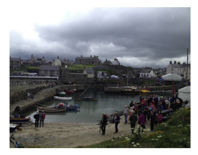
Fig. 3. Traditional Boat Festival, Portsoy.