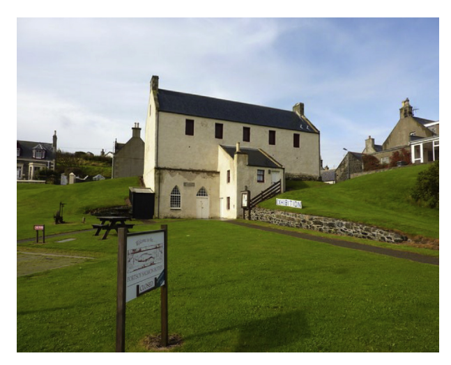
Fig. 4. Portsoy Salmon Bothy.

the Traditional Boat Festival and continues to thrive due to the role volunteers' play in sustaining it as a community enterprise: