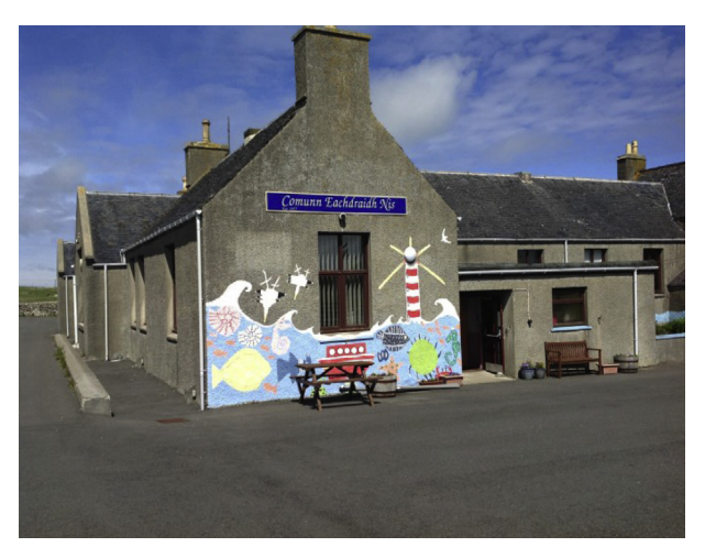
Fig. 1. CE Nis (Ness), Lewis.

Portsoy is a small fishing town that has a harbour that dates to the late seventeenth century. The Portsoy Salmon Bothy developed from the success of the community organised Scottish Traditional Boat Festival (see Fig. 3), which began in 1993 to celebrate the harbour's tercentenary. The hosting of the festival, which originally had its focus upon small Scottish traditional sailing boats, was initially highly successful, and so became a yearly event that grew in popularity due to community and volunteer efforts. The festival developed to integrate other cultural aspects into its remit as it grew, including music, food and craft. This success led to the development of the Salmon Bothy. Once an ice house (Fig. 4) for the Salmon fishing industry (that ended in 1993), it was refurbished and re-opened in 2011 due to volunteers securing funding for its restoration. The Bothy is a museum, community space and office for