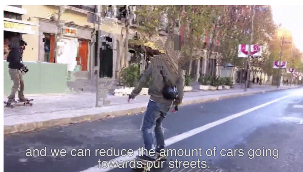
Fig. 4. MoMi Activists re-appropriate the streets.

case, members of the local population were observed to use a secondary less shaded square at midday so as to free a more popular square for the use of tourists. Further discussions revealed the understanding of local people of the economic benefits brought by tourism to the community and also that they were willing to forgo