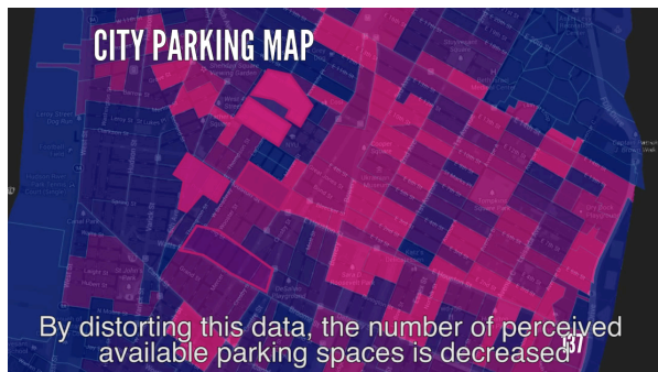
Fig. 3. City dashboards display false data indicating occupied parking spaces that are in reality vacant.