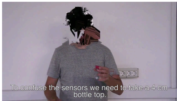
Fig. 1. MoMi Activists describing how to create a DIY device to confuse sensors.