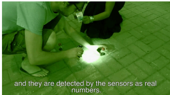
Fig. 2. Deploying the DIY devices on to car parking sensors.