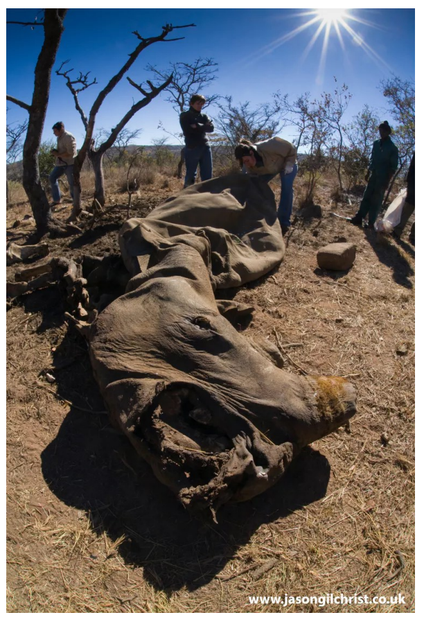
Veterinary post-mortem of a dead female white rhino in South Africa. The animal wasn't poached as it still has its horn (regrown after being dehorned for its own protection).