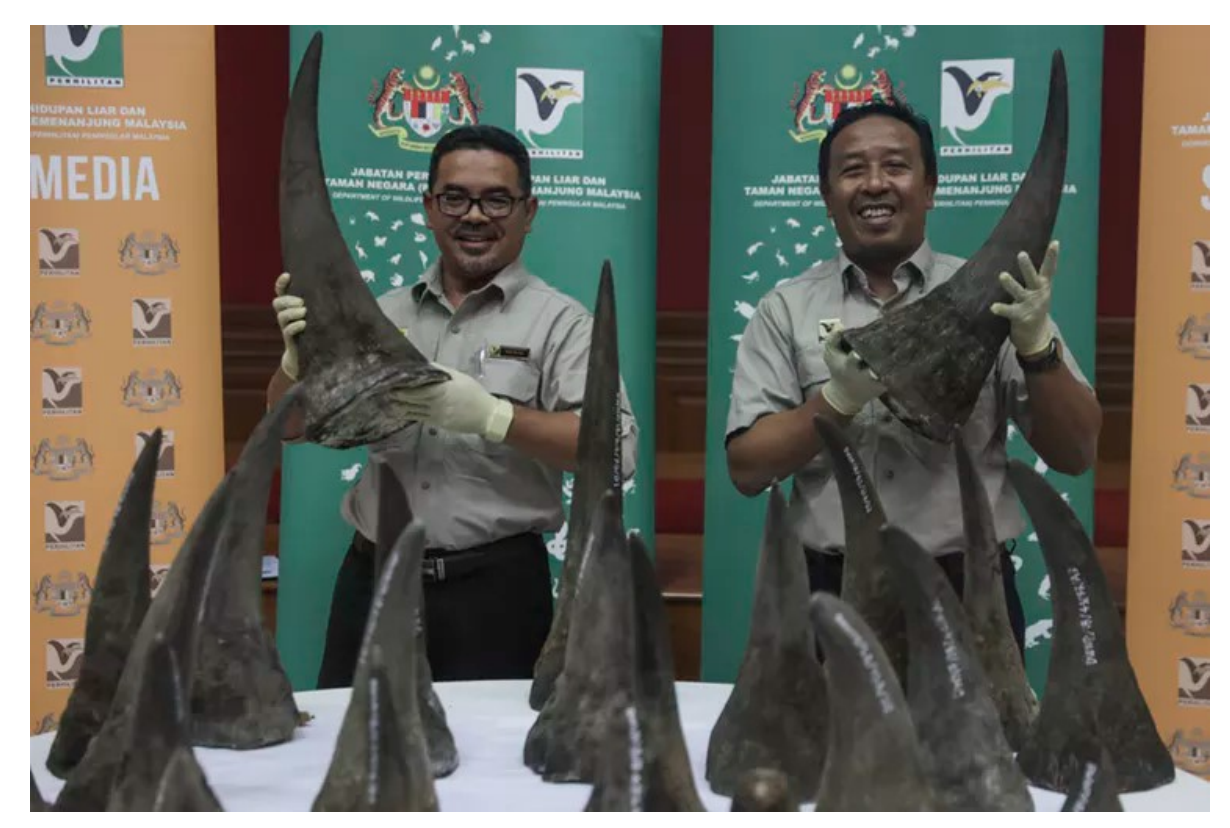
Malaysia authorities seize 50 African rhino horns worth €10m.

However, South Africa recently undermined efforts to reduce demand by lifting its ban on the domestic rhino horn trade. This has made life a lot more difficult for law enforcement as a legal trade sends out the message that rhino horn is valuable, and so facilitates an illegal trade. The recent release of a Thai rhino kingpin from a South African jail only six years into a 40-year sentence raises further questions of the country's commitment to tackling wildlife crime.