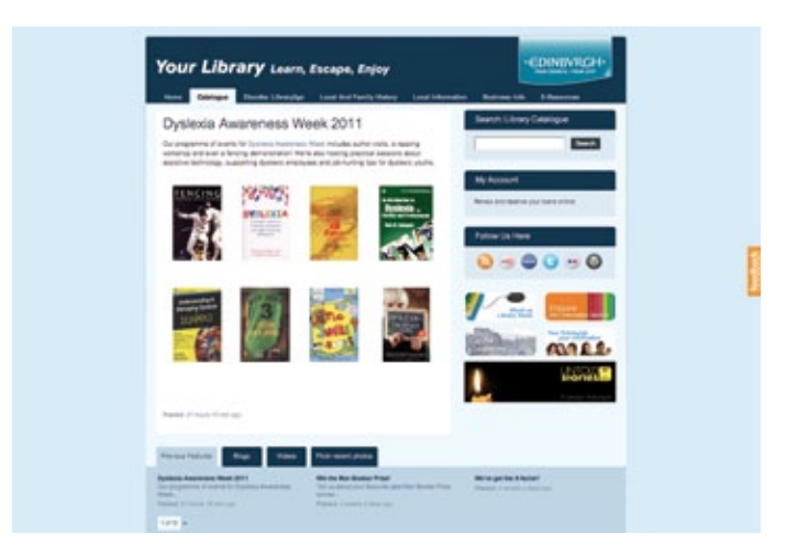
Figure 1 – The YourLibrary website

The Virtual Library<sup>1</sup> was launched at the EDGE conference in 2010. The portal is unique in that it unites all their digital resources, including catalogues, databases, and other websites, in one single interface as part of the overall transformation programme for the service. The portal makes it easy to join, renew, reserve, download, use and learn with high quality electronic resources.