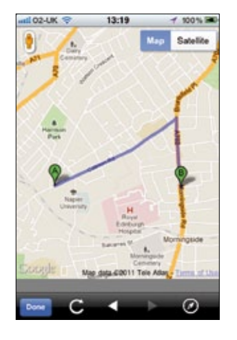
Figure 6 - Directions to selected library - screenshot from iPhone App

The App has been designed to be cross-device, meaning it is available to all of the main Smartphone platforms: iPhone, Android, Blackberry and Windows Phone. Library users can get the App free of charge by downloading it from the relevant App store. A dedicated QR code (see box below) can also be published locally to drive uptake of the App. Users scan the code on their phone and are automatically directed to the relevant App store. In this environ¬ment, there is only one logical business model: councils are a charged for the back end service, but access to content and the Apps are free to citizens. The development of the system has been carried out with Talis, the suppliers of the Library management system.