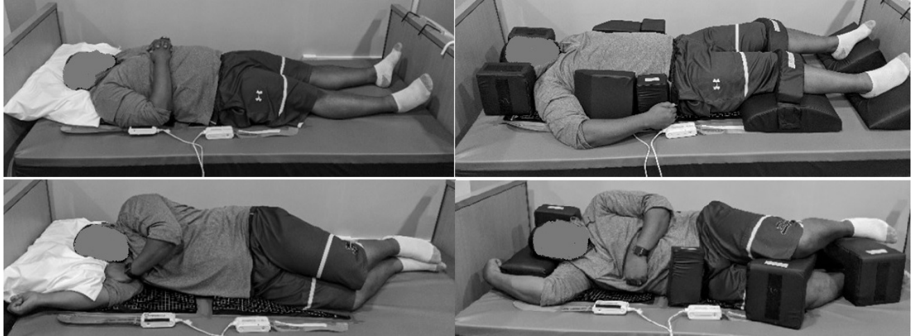
Figure 1. Top left: supine lying control without Postural Management System (PMS). Top right: supine lying control with PMS (Top right). Bottom left: side lying position with PMS. The PMS system bed sheet is placed over the pressure sensors to enable the proper attachment of PMS

The shoulder region, most specifically the scapulae is another region that is at risk of developing pressure injuries when placed under prolonged stress (5). In this study, through use of the PMS peak pressure at the shoulder was reduced compared to the control test condition in supine lying, providing further potential clinical benefit in PMS use as a whole-body system to manage body-mattress interface pressure. In the supine test condition, pressure at the ischial tuberosities were greater in the PMS condition compared to the control condition. When positioned in the PMS, the knees and hips are slightly flexed which may in turn transfer pressure towards the buttocks. However, a peak pressure value of 1.32 KPa, as recorded at the ischial tuberosities with the PMS in supine is not considered large enough to cause ischemia within the compressed tissues, with an acceptable threshold for pressure when sleeping