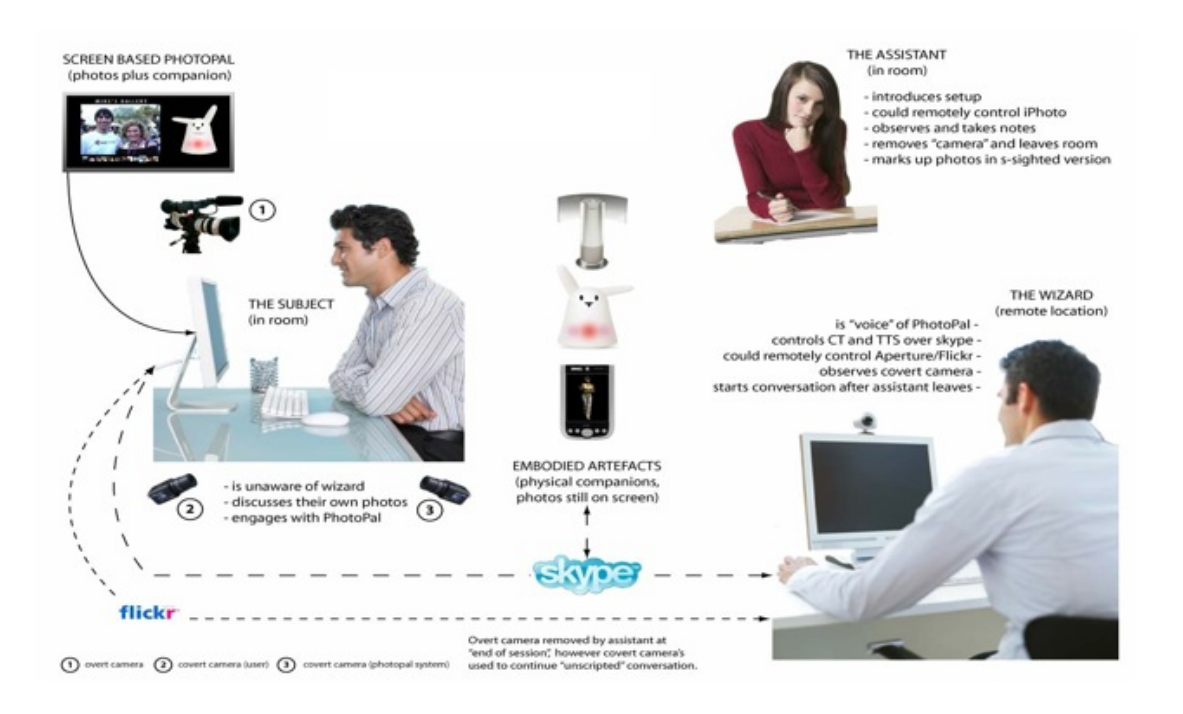
Figure 1: The WOZ1 setup used to collect data