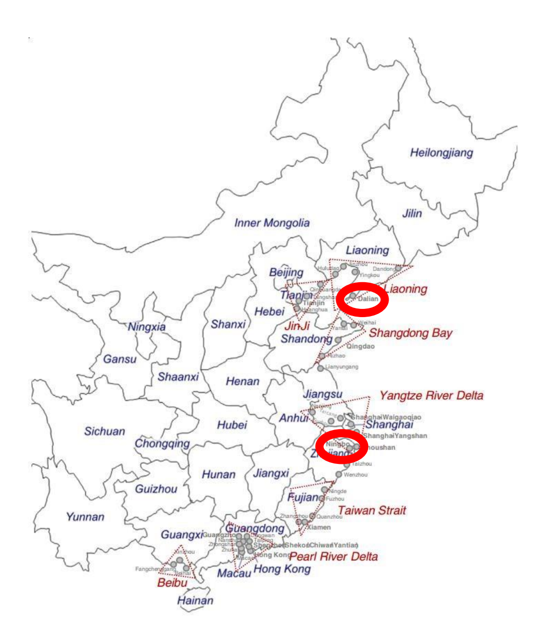
Figure 5.1 Location of Ningbo-Zhoushan port and Dalian port.