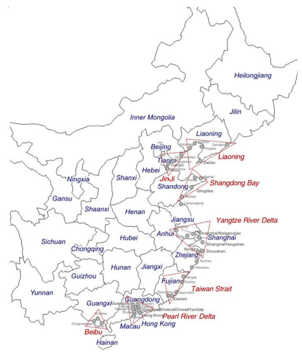
Figure 4.2 Geography of the Chinese seaport system ( (Notteboom, T. and Yang, Z., 2017).

end of 2015, China had 31259 berths, including a total of 2221 berths having the capability of serving ships of over 10,000 dwt. Of these berths, 1807 are distributed among the country's coastal ports that capable of serving ships of 10,000 dwt (Stats.gov.cn., 2016).