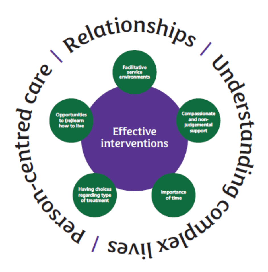
Figure 2. Components of effective substance use treatment from the service user perspective

Line of argument synthesis A range of components are required for treatment to be perceived as effective: facilitative service environments; access to harm reduction and abstinence based treatments; compassionate and non-judgemental support; interventions that are long enough in duration; choices in terms of treatment; and opportunities to (re)learn how to live. These components should be provided within a context of good relationships, person-centred care and an understanding of the complexity of people's lives.