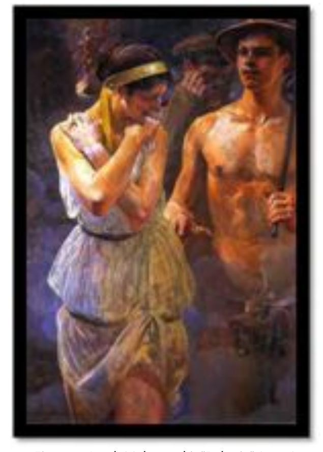
Figure 3: Jacek Malczewski, "Polonia" (1914)