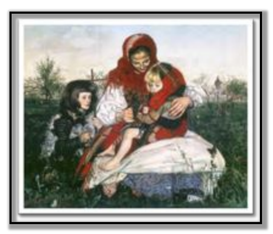
Figure 1: Vlastimil Hofman, "Madonna with a Child and St. John" (1909).

The Holy Mother is represented as the beautiful Polish woman, and she is the symbol of holiness; gender roles and duties are once again re-inscribed on the female body through the equation of motherhood with sacredness. The consequences are ubiquitous and perhaps paradoxical. As Ewa Hauser (1995, 89) writes: