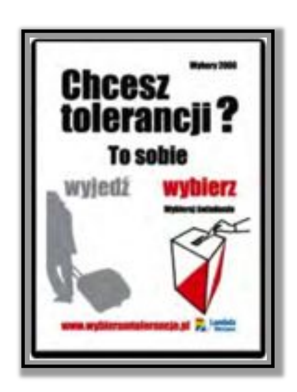
Figure 9: "Want Tolerance? So Choose One"

It was an outreach activity with posters put in places frequented by gay and lesbian people (bars, clubs, coffee bars, "gay friendly" venues).