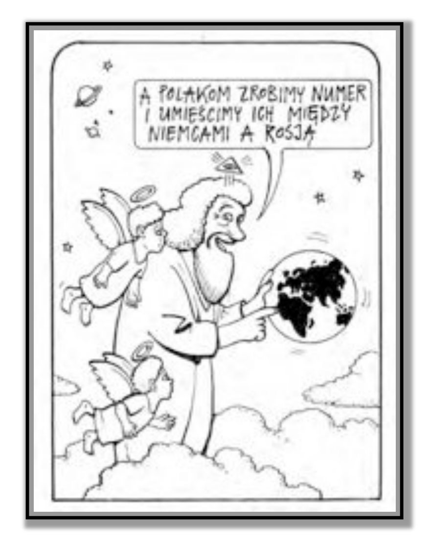
Figure 5: Copyright by Andrzej Mleczko.

scholars, in the context of Polish nationhood, the geographical location of the centre, between Germany and Russia, "West" and "East", was of a special importance (Kostrzewa 1990; Walicki 1994a; Jedlicki 1999; Janion 2007). This was sharply summarised by Polish satirist Andrzej Mleczko with the following cartoon: