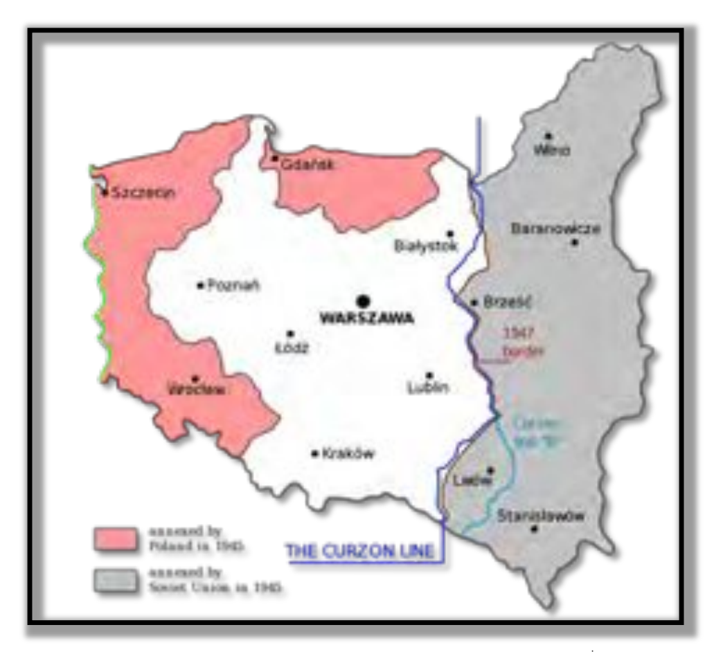
Figure 6: Poland after WW II

The salmon-coloured western territories are called in Polish "ziemie odzyskane" - "restored/regained lands", whereas the grey ones - "ziemie utracone" - "lost lands". The "lost lands" are today's Ukraine, Belarus, and Lithuania. Polish past orientalising and colonising attitudes towards these lands are not only well documented (see: Janion 2007 for a particularly acute and detailed overview of literature about Polish attitudes towards "Kresy"/ziemie utracone"), but also present in contemporary language. In the standard expression, like "to go to Germany" ("jechać do Niemiec"), a preposition 'do' - 'to' is used. However, when the same sentence refers to one of the "lost lands", a different preposition of place is used: 'na' ("jechać na Ukrainę/Białoruś/Litwę"). It implies possessiveness and is used in an action when a subject does something to/on an object that is in their possession - a connotation that is not present in the standard 'do' preposition. It is also common to talk about Poland while discussing The