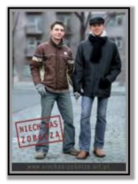
Figure 7: "Niech Nas Zobacza" / "Let Them See Us" (2002)

gays are not sensational. If lesbian and gay people look so normal and ordinary, they are as normal as the viewer themselves ^{xviii} .