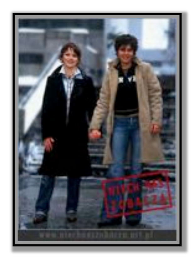
Figure 8: "Niech Nas Zobacza" / "Let Them See Us" (2002)