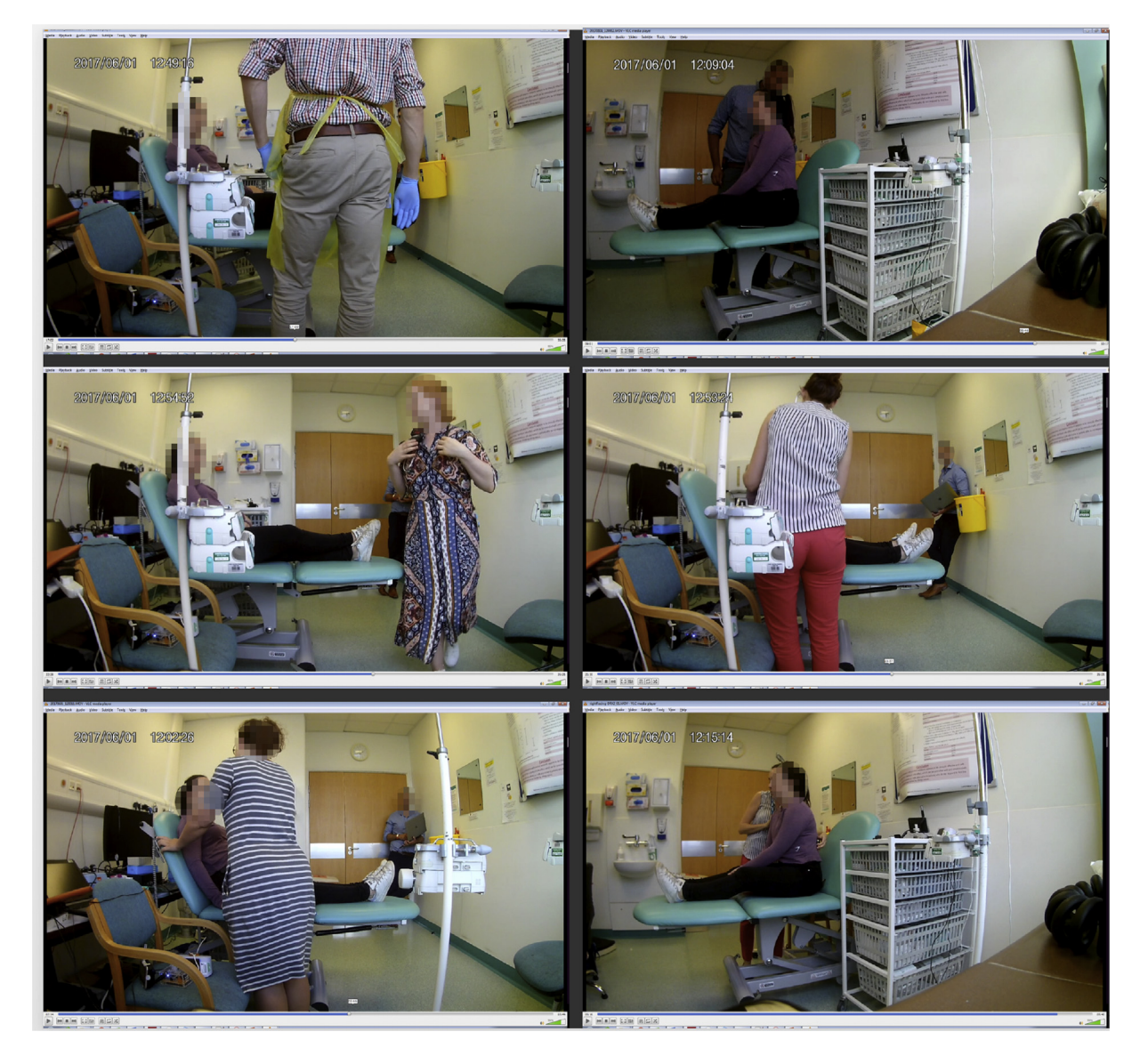
Figure 1. Example of mock procedure footage from one of two camera angles.