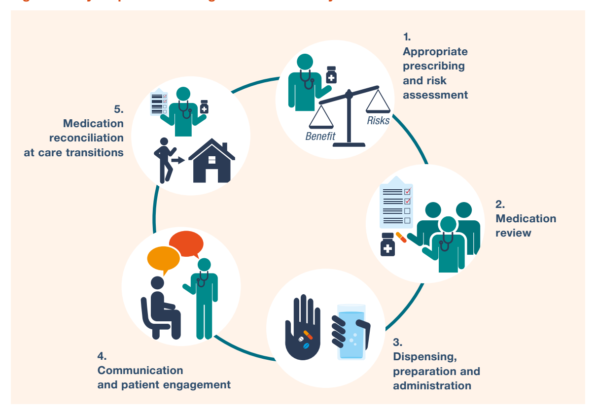
Figure 1. Key steps for ensuring medication safety

The events leading to the error in this scenario and how these could have been prevented are reflected in Figure 1, and the text below.