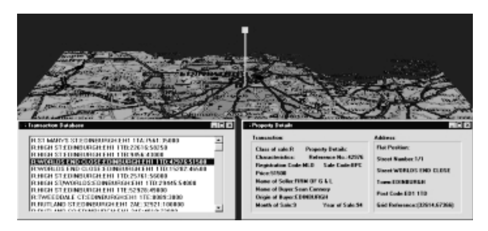
Figure 4 Combined 2D & 3D metaphors for a property transactions database