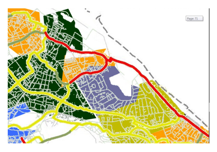
Figure 4 Route and its underlying demographic

The target audience of the MELA geographically fitted with the cycle route. The MELA was already marketed to a wide local audience, and in working with them value-for-money was achieved through being able to target a ready-made group of people (e.g. through social media and other communications, as well as at the event itself).