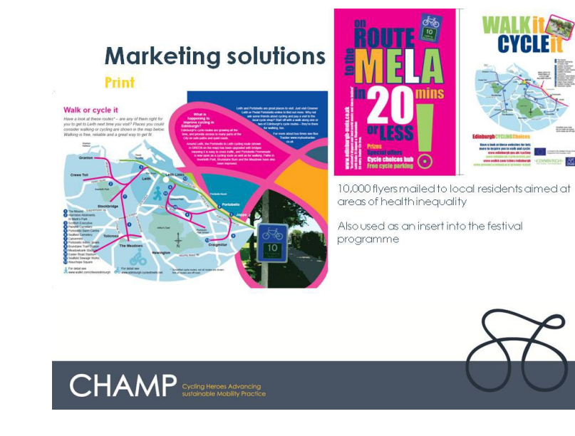
Figure 5 Marketing Material