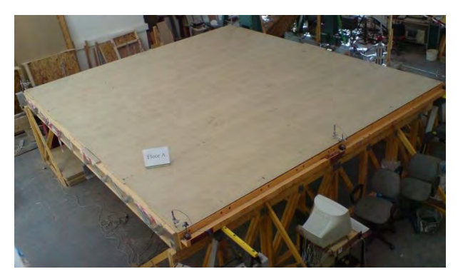
Figure 1: A typical metal web joist floor (Floor A)

ceiling (with or without). Figure 1 shows a typical metal web joist floor (Floor A). Figure 2 shows a strongback fitted along mid-span of a floor.