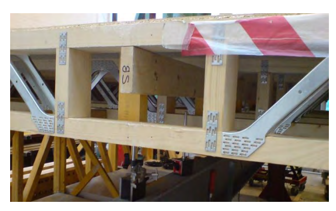
Figure 2: A TR26 strongback at mid-span in Floor E