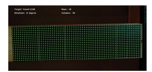
Fig. 3 Selected round regions

In (5), if each camera's focal length f_l , f_r and the coordinates of the spatial point in both left and right images are known, the three-dimensional coordinates of the point in WCS can be obtained. Rotation matrix and translation transform vector can also be obtained by calibration.