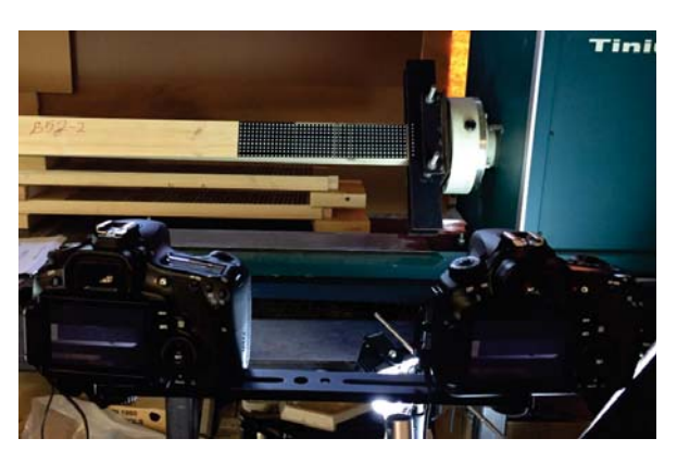
Fig. 2 Target points reconstruction of binocular stereo vision

According to the pinhole imaging theory the following expression can be made,