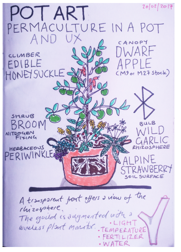
Figure 2. The layers of permaculture and UX, in a pot.

feedback; 5. Use and value renewables and services; 6. Produce no waste; 7. Design from patterns to details; 8. Integrate rather than segregate; 9. Use small and slow solutions; 10. Use and value diversity, 11. Use edges and value the marginal; 12. Creatively use and respond to change.