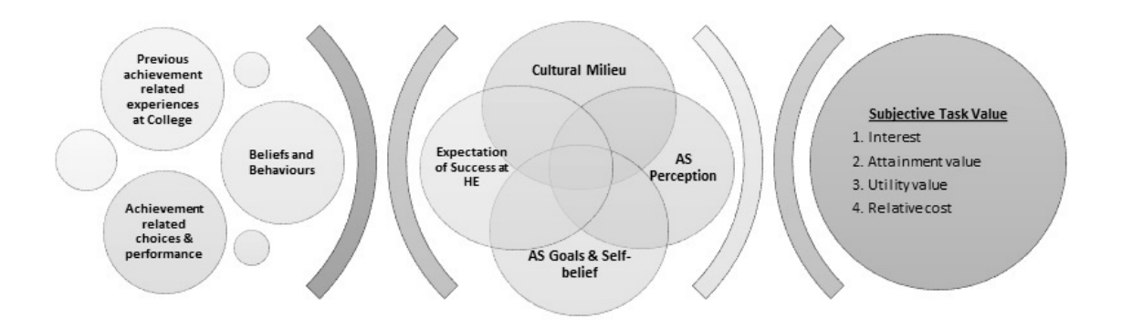
Figure 1: Based on Wigfield and Eccles' 'Expectancy Model of Achievement Motivation' (2000) and its application to Associate Students (AS).

The 'Expectancy Model of Achievement Motivation' (Wigfield and Eccles, 2000) is an appropriate framework to evaluate the propensity for academic success before a student has made the transition from FEI to university. Eccles et al. (1983) proposed the earliest incarnation of this model and it has since been developed by Eccles, Wigfield and their colleagues over the ensuing years (see for example Eccles, 1984; Wigfield 1994; Wigfield and Eccles, 1992 and 2000). The model is related to theories such as Bandura's (1997) 'Self-Efficacy Theory', which makes use of expectancy and efficacy beliefs to forecast achievement capabilities, but is most closely connected to Atkinson's (1957) 'Expectancy-Value Theories' which links achievement performance, persistence and choice.