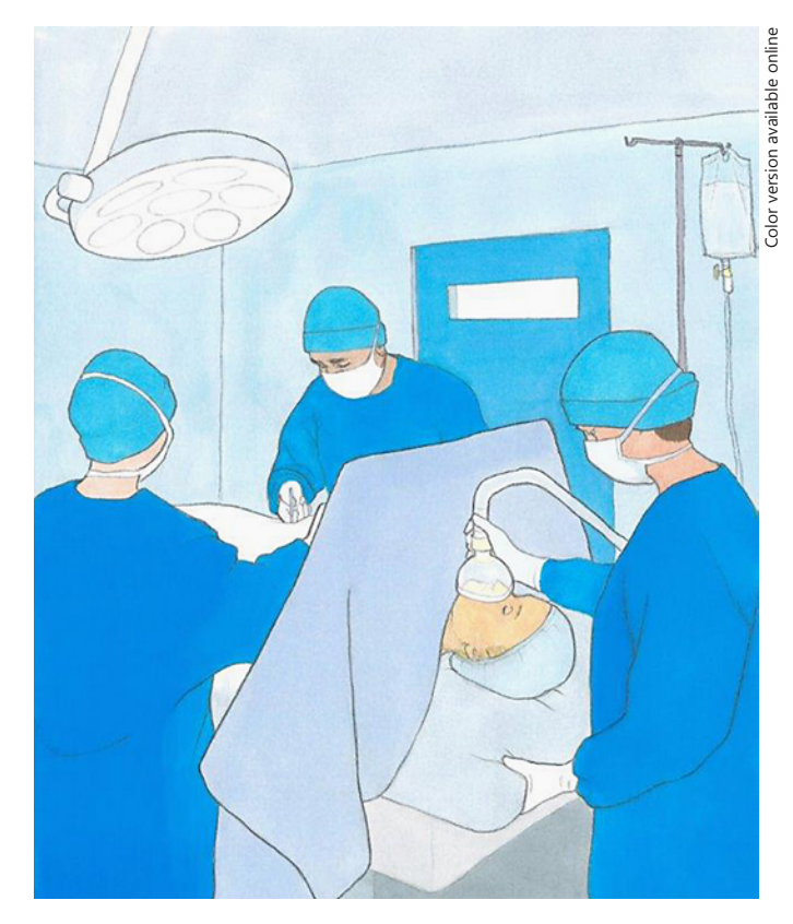
Fig. 2. A picture from the booklet Lucie est soignée pour un cancer , showing surgery being performed on the patient.

from colorectal cancer [64], whilst another case study [63] found that 1 male patient with ID had died before a cancer diagnosis was made. The authors of this review found no systematic studies or evaluations unanimously indicating whether colorectal cancer was diagnosed late in PWIDs.