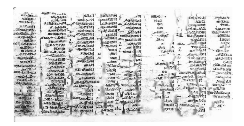
Fig. 2a: Hieratic dream book, 1245–1190 BCE, Dynasty XIX. Papyrus, black & red ink, cursive hieratic. Chester Beatty III, sheet 3, recto, columns 8–11. British Museum, London. Museum number: EA10683,3.