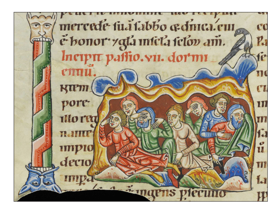
Fig. 3: Seven Sleepers of Ephesus, detail, 1170–1200, Passionary of Weissenau (Weißenauer Passionale), 127, fol. 125v. Fondation Bodmer, Coligny, Switzerland Cod.

The midday ones, the nightly, the daily, the bi-daily, the three daily [---] or whatever sort you are: I conjure you [---] you may not have leave to harm this servant of God by day or night, neither waking or sleeping [---]. (trans. Simek 2011: 36).