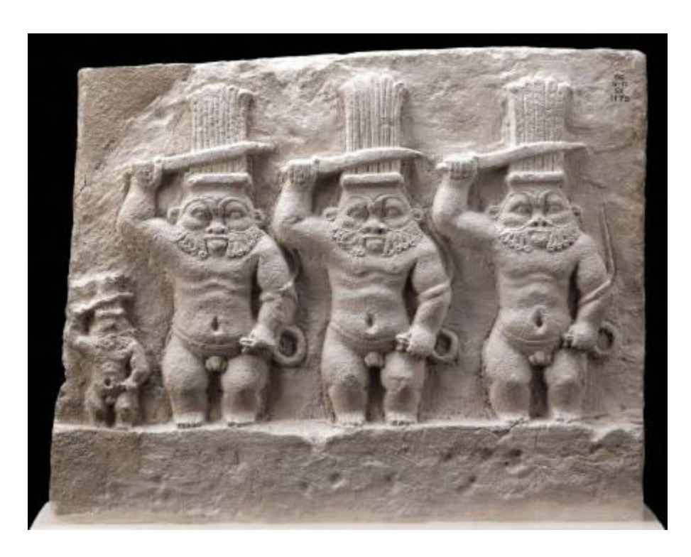
Fig. 2b. Headrest of Qeniherkhepeshef, carved with protective figures of Bes, 1225 BC, 19th Dynasty, Deir el-Medina, Egypt. Limestone, 18.8 x 23 x 9.7cm. British Museum, London. Museum number: EA63783.