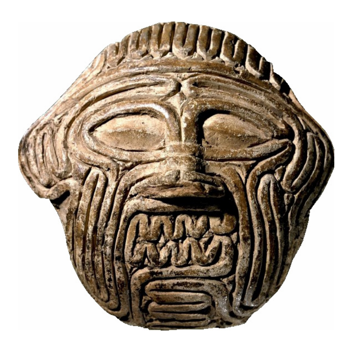
Fig\ 1a: Humbaba,\ 1800BCE-1600BCE\ (Old\ Babylonian),\ Abu\ Habba,\ South\ Iraq.\ Fired\ clay\ mask.\ 8.3\ x\ 8.4\ cm.\ British\ Museum,\ London.\ Museum\ number:\ 116624.\ Photo:\ The\ Trustees\ of\ the\ British\ Museum.