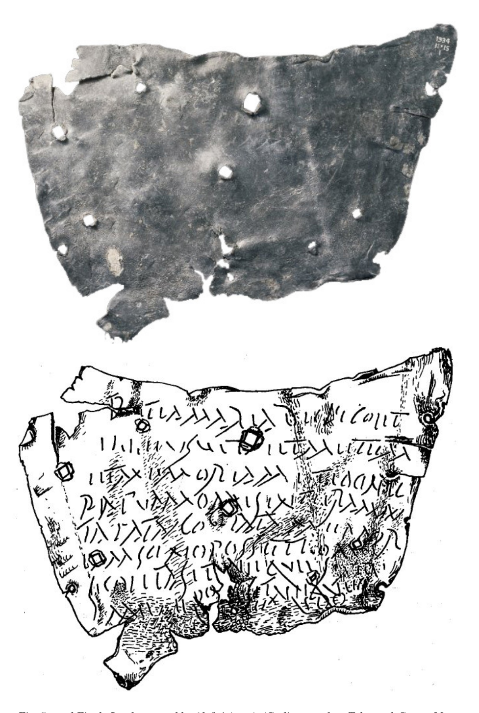
Fig. 5a and Fig. b: Lead curse tablet (defixio), c. 1–4C, discovered on Telegraph Street, Moorgate, London. British Museum, London. Museum number: 1934,1105.1. Photo and drawing: The Trustees of the British Museum.