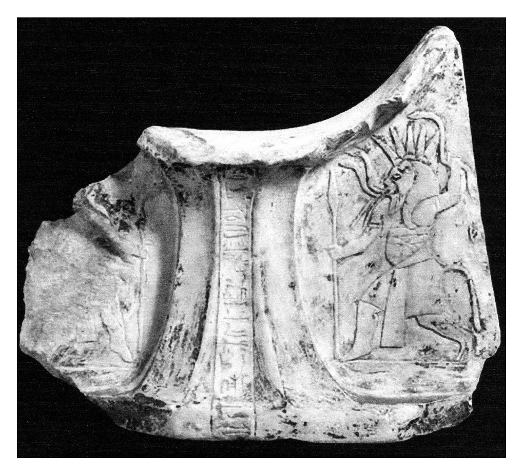
Fig. 2c. Headrest of Qeniherkhepeshef, carved with protective figures of Bes, 1225 BC, 19th Dynasty, Deir el-Medina, Egypt. Limestone, 18.8 x 23 x 9.7cm. British Museum, London. Museum number: EA63783.

Chester Beatty III, sheet 3, recto, columns 8–11). His funerary head-rest depicts the grotesque dwarf-god Bes, waving snakes to fend off dreams (Figures 2b and c); the inscription reads: "a good sleep within the West, the necropolis of the righteous" (Pinch 1994: 43, 58–59; cf. Milne 2010: 178). Many such head-rests, used into the Roman era, have been found; some ceremonial and destined for tombs, others used in everyday life. An early and popular protection against nightmares was thus to repel the demon with a representation of itself.