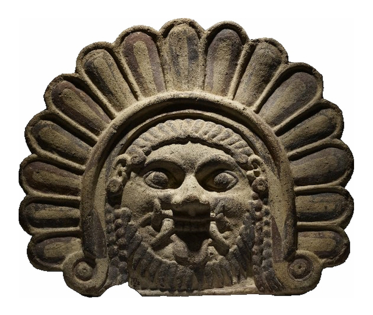
Fig. 1b: Gorgoneion within arched frame, c. 500BC, Campania, Italy. Terracotta antefinial. H: 29 cm. British Museum, London. Museum number: 1877,0802.4.