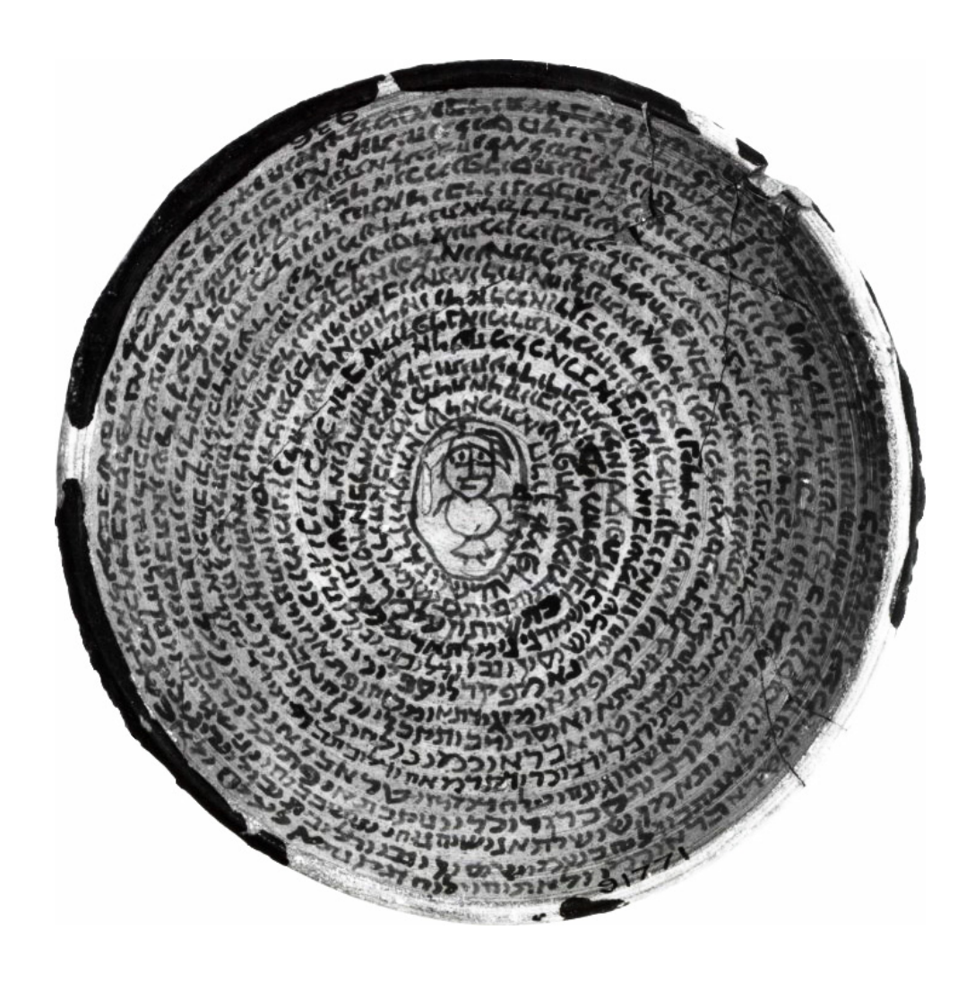
Fig~4: In cantation~bowl,~6-8C, Iraq.~Ceramic,~with~Aramaic~inscription.~15cm~diameter.~British~Museum,~London.~Museum~number:~91771.~Photo:~The~Trustees~of~the~British~Museum.