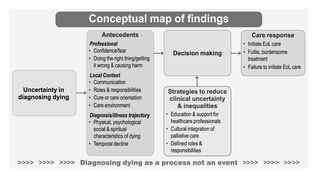
Figure 1 Conceptual map of findings.

The search of electronic databases was comprehensive and included the Cochrane Central Register of Controlled Trials (CENTRAL) on The Cochrane Library , MEDLINE (1950–2011), EMBASE (1980–2011), PsycINFO (1980–2011), CINAHL (1982–2011), Web of Science and Google (to September 2012*). Key search terms included combining *diagnosis (MeSH Diagnos*) with Death*, dying and care. End of life* was combined with Diagnos* and key words such as Recognis* and Instrument*. The search strategy is detailed in box 2. Results from Web of Science and Google were subsequently removed as the search of other databases was discriminating enough and these