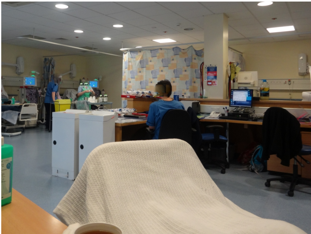
Figure 2: Staff and patients in the dialysis environment, active and passive care being delivered simultaneously as they are visible and available to patients