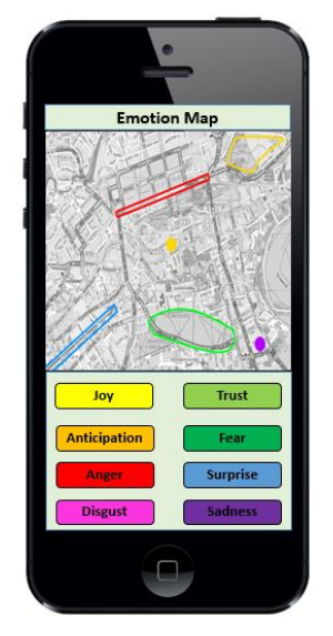
Figure 3: Example of an emotion map based on emotion categories. The emotion categories are based on the eight basic human emotions of the Plutchik Emotion Wheel.

Due to the limited insight provided by arousal maps regarding a person's actual emotions connected to places in the urban environment, more recent studies make use of emotion maps based on emotion categories (Mody, Willis, and Kerstein 2009; Matassa and Rapp 2015; Quercia, Schifanella, and Aiello 2014; Resch et al. 2016). For example, Matassa and Rapp designed and developed a concept for a smartphone app for cyclists called UMap, which aims to enhance people's reminiscing of past experiences by linking them to the context (i.e. places) in which they occurred (Matassa and Rapp 2015). The mobile app registers contextual data both automatically and by self-reporting. Sensors in the mobile phone are used to automatically collect quantitative contextual data such as time, GPS location and weather conditions. Additional qualitative data such as emotions, notes and media in the form of pictures and videos are not automatically registered, but can be added manually by the user. Emotion maps that do attempt to depict a person's actual emotions connected to a place (i.e. rather than arousal levels), as the one depicted in Figure 3, typically use simplified emotion categories based on qualitative measurements or crowdsourced data, thus limiting the range of emotions on the resulting emotion map (Mody, Willis, and Kerstein 2009; Matassa and Rapp 2015; Quercia, Schifanella, and Aiello 2014; Resch et al. 2016).