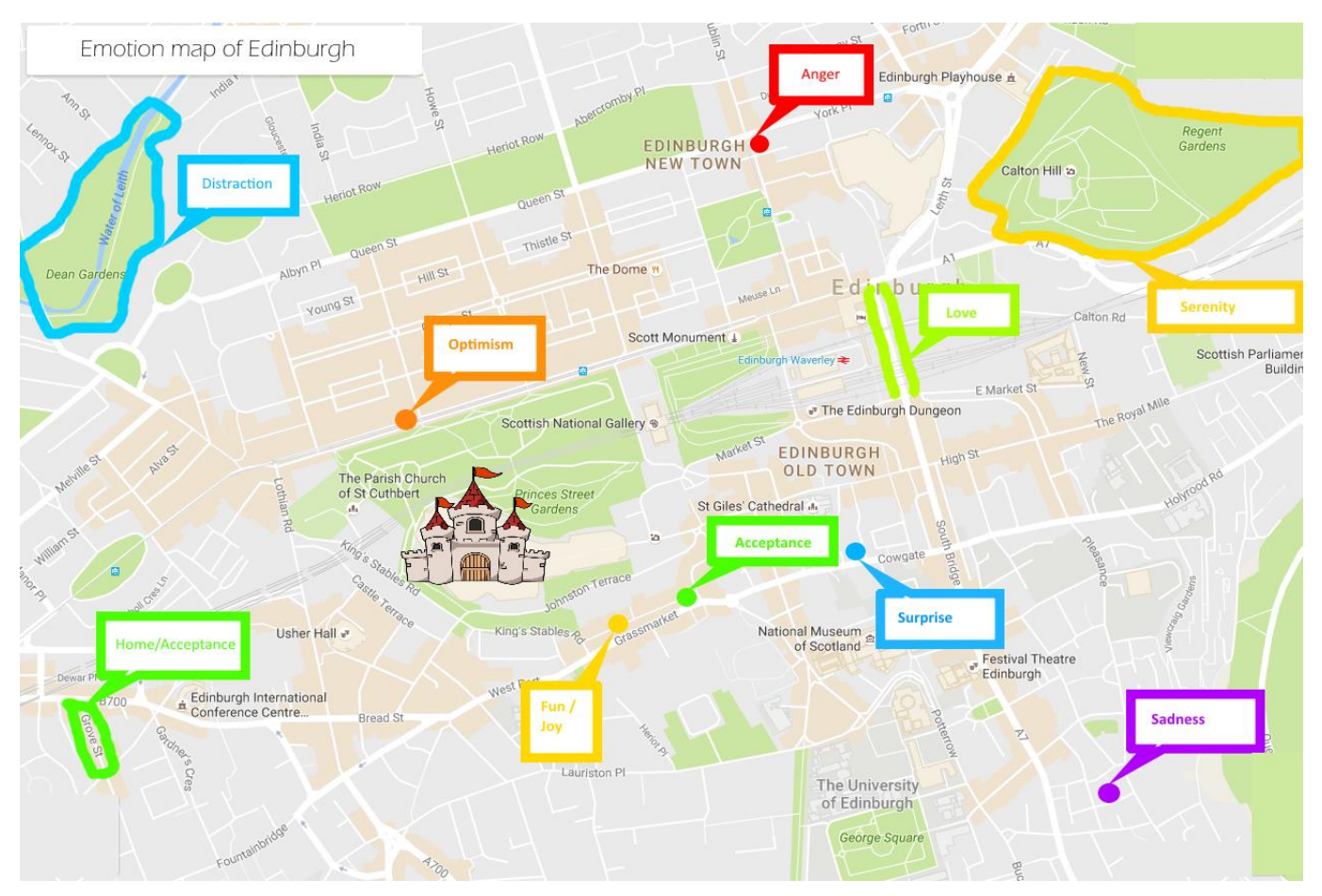
Figure 5: Emotion map of Edinburgh, used as a provocation in a speculative design approach.

This provocation is intended to stimulate reflection and critical attention within participants on their current personal, emotional relationship with places in the urban environment, and how such personal geo-located emotion data might be used, explored and shared using emotion maps in the (near) future. The emotion map is intended to act as a catalyst and conversation piece to help participants imagine and reflect on a future scenario in which personal data regarding other people's emotional bonds with places in the city would be available to them in the form of an emotion map, and how they could potentially use such a map. The emotion map contains different types of positive and negative emotions connected to specific locations and areas in the city, with each emotion indicated by a different colour. A specific aim is to investigate the potential influence of the different types of emotions connected to places, on the relevance of these person-place relationships to other people, and people's interest in exploring this personal data. Our hypothesis is that the participants will be more interested in places with extreme positive or negative emotions connected to them (e.g. anger and love) (Stals, Smyth, and Mival 2017a).