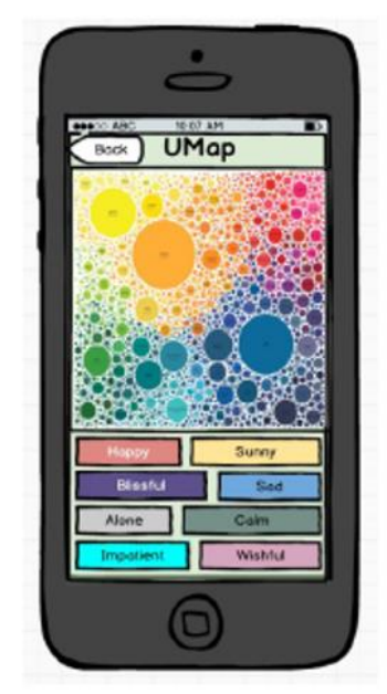
Figure 4: Example of an abstract emotion map based on emotion categories, used in a concept for the UMap app to enable reminiscing.

Although the different types of emotions in the specific emotion categories thus appear to vary across the literature, the emotion categories on an emotion map are typically visualized by assigning a different colour to each of the emotions (see Figure 3). The emotions appear as coloured dots at the relevant locations on the emotion map, or sometimes a user or participant is allowed to define a customized area on the emotion map as well, as can be seen in Figure 3. However, the specific details of the resulting visualizations can differ across the literature as well. In a slightly more abstract emotion map proposed by Matassa and Rapp as part of their emotion map app for cyclists for example, the different emotion categories are depicted by different coloured circles on the emotion map (see Figure 4). The size of the circle could then be used to, for example, depict the intensity of the emotion linked to the memory in that place. Furthermore, the emotion map is interactive, allowing memories and places to be added and removed, and the emotion connected to a place to be changed, thus taking into account the temporality of emotions (Matassa and Rapp 2015).