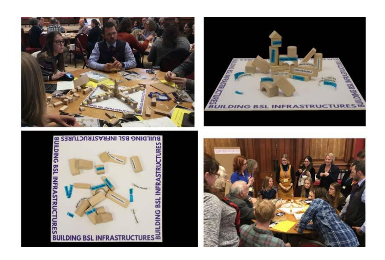
Figure 4 The 'Building Infrastructure' outcomes