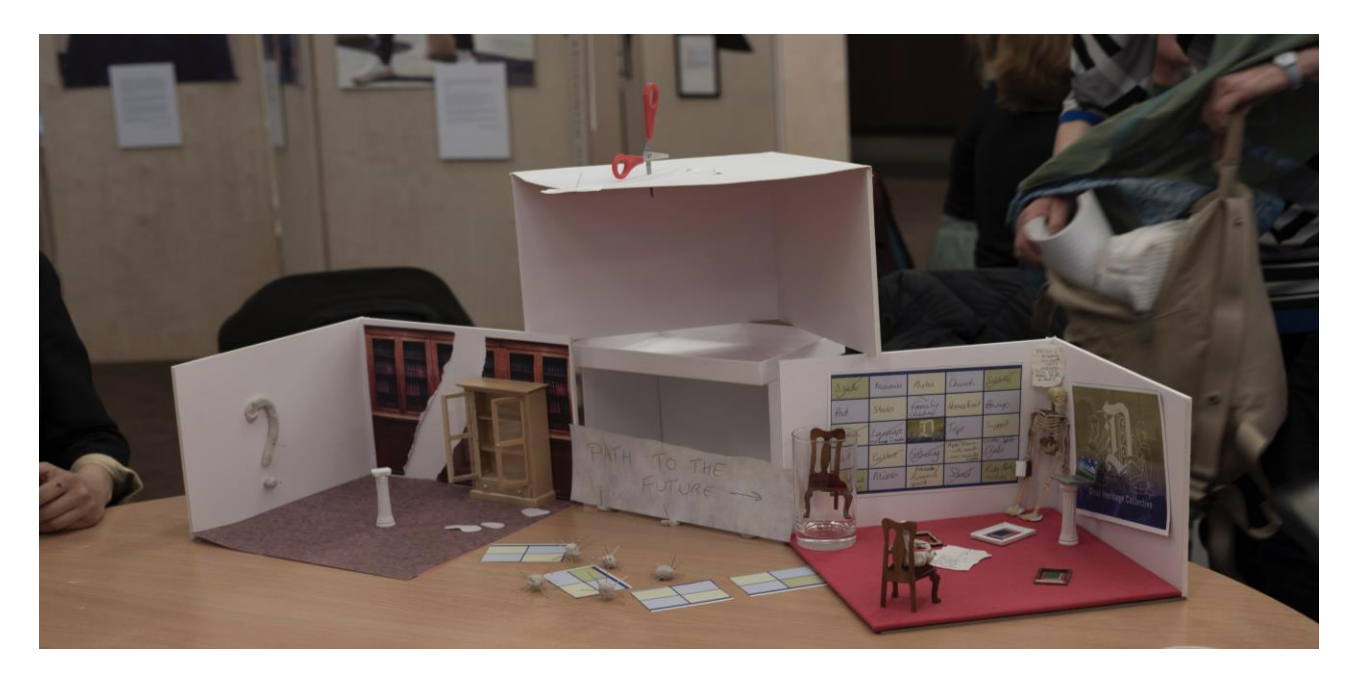
Figure 2 Outcomes of the 'Collaborative Curating' activity, showing an aesthetic we might describe as an activist style