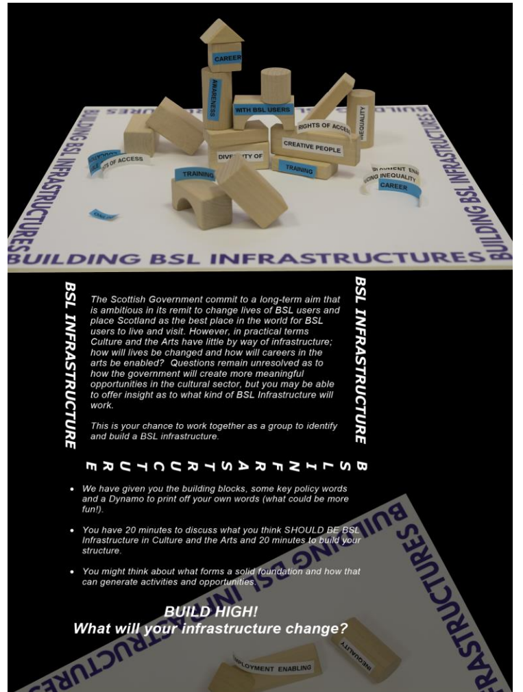
The brief stated

Our second workshop provided an opportunity to develop an activity that responded to the concept of 'BSL Infrastructure', which had emerged through the first workshop's discussions. The concept offered a useful way to think about the entangled material and immaterial resources required to create equality in Scotland's heritage sector. We devised a BSL Infrastructure probe kit comprising children's' wooden bricks, a dynamo, paper, sellotape and scissors.