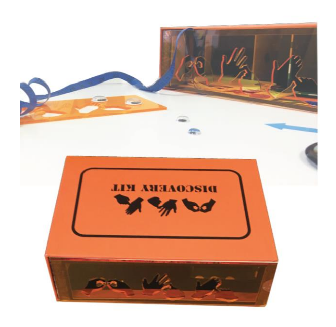
Figure 6 'BSL Discovery Kit'

Participants were slow to engage with this activity. It emerged through discussion that Deaf participants initially saw this activity as