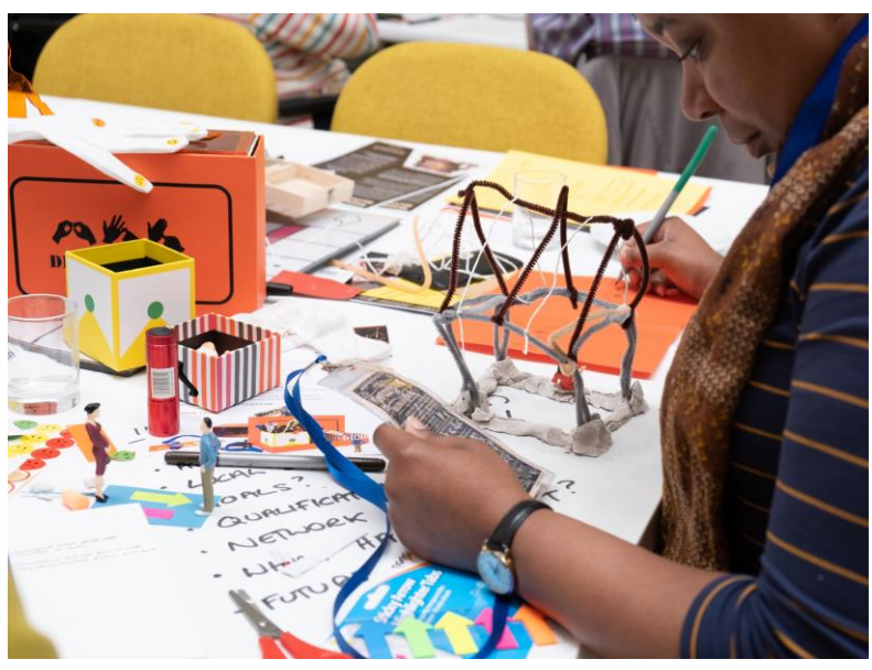
Figure 7 'BSL Discovery Kit' participants at work