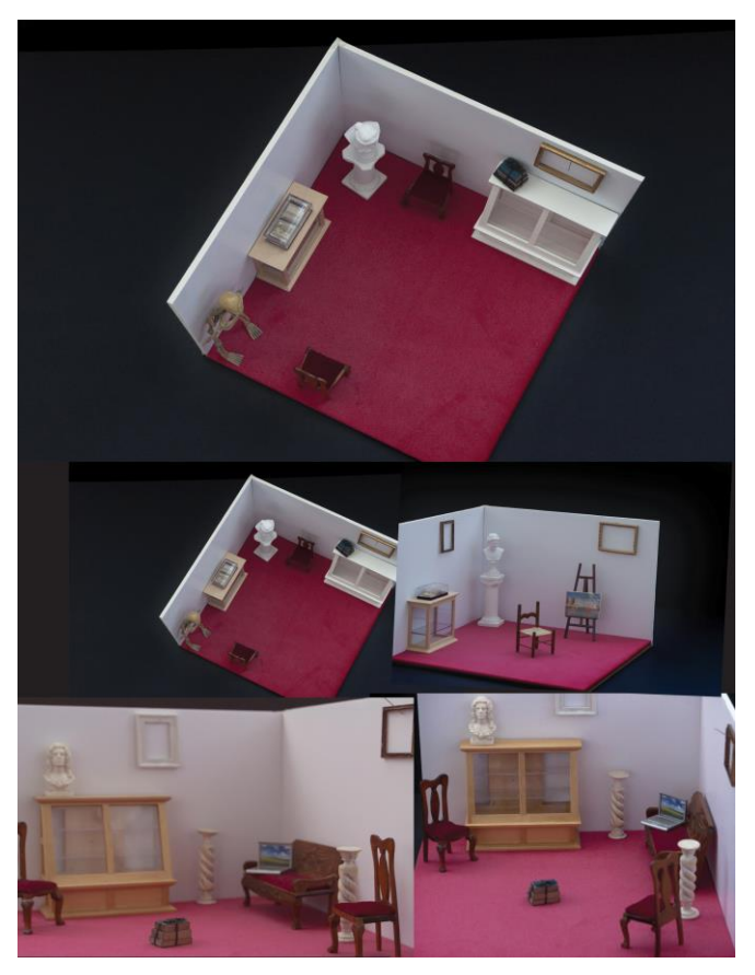
Figure 1 The 'Collaborative Curating' brief given to participants with intersection of museum space and museum and props

The roundtable discussions that followed were intense and revealed divisions as to how Deaf heritage should be narrated. The process of collaboratively making the museum provoked discussion and dissensus around a number of points; the importance of telling the story of