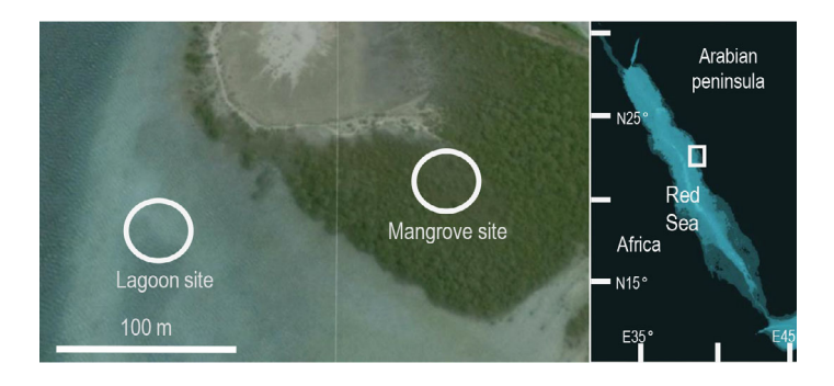
Fig. 1. Location of the incubation (lagoon and mangrove) sites in the Red Sea.

The incubations were conducted in a mono-specific Avicennia marina mangrove swamp of the central Red Sea (22°20'23"N, 39°05'22"E, Fig. 1), in the King Abdullah University of Science and Technology Ibn Sina field research station and conservation area (Saudi Arabia). Coastal expansion of mangrove in the Red Sea is limited by the small tidal range, approximately 20-30 cm in the central part of the Red Sea, combined with seasonal variations of water level, decreasing from May to August of approximately 50 cm and re-increasing thereafter till October, exposing mangroves to increasing period of emersion throughout summer (Pugh and Abualnaja 2015). The water column in our site classically varies between complete emersion and \sim 30–40 cm depending on the tide and period of the year, which is representative of Red Sea mangroves. Red Sea mangroves thrive in one of the driest areas of the planet, with precipitations ranging from 10 to