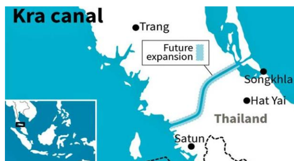
Figure 1. The location of Kra Canal

Notably, the Kra canal is a huge-scale infrastructure project. The proposal is it will be approximately 102 km long (in contrast to the Japanese estimate of 50km from the 1980s), 400 meters wide, and 25 meters in depth, and sufficiently large enough to allow for any cargo vessel type, including ultra large crude carriers with a 300,000 deadweight tonnage (Rahman et al., 2016; Heng and Yip, 2018). Yet, despite such challenges, the potential benefits are huge. For example, it is estimated the canal can shorten shipping times by two to three days compared to the Malacca Straits route (Lam, 2018). Such benefits bring savings in time, crew costs, fuel consumption, and emissions reductions, thereby enhancing CSR. Also, the Kra canal can avoid threat of pirates, congestion and potential accidents in the Strait of Malacca 3 (see Figure 1) (Heng and Yip, 2018), meaning safer and more secure passages for goods, reduced insurance costs, and safer passages for personnel. The canal also has the potential for the development and evolution of any feeder or hub ports, and for those servicing the canal in Thailand.