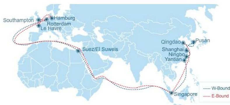
Figure 3 Shipping routes in Far East-Europe Loop 2

In addition, some stand to potentially lose business from the development of the Kra canal, certainly in the short to medium term. For example, Singapore Port's business will potentially be significantly affected if the Kra Canal is constructed and shipping companies switch routes along the Europe-Asia route. Taking Yang Ming container shipping company (Far East-Europe Loop 2) as an example, the route is rotated as Qingdao - Pusan - Shanghai - Ningbo - Yantian - Singapore - Rotterdam- Le Havre-Hamburg- Rotterdam-Suez/EL Sweis-Qingdao (Figure 3).