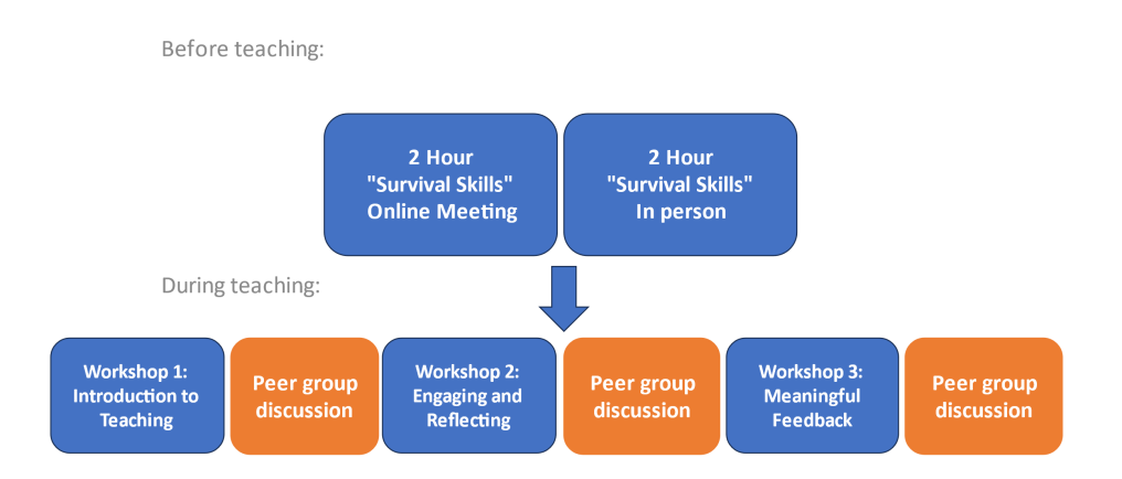
Figure 3. Format of the new programme of a two-hour online introduction to learning and teaching, followed by a two-hour in person microteaching workshop before teaching. Following this, three workshops with peer support sessions in between run during the teaching times for PGRs

Once both are completed, PGRs are equipped with a foundational training basis for their early teaching experiences. Throughout the semester, three additional workshops offer timely support for separate phases of teaching: beginning teaching early in the semester, engagement/reflection mid-semester, and meaningful feedback/marking end of semester. Between each workshop, peer-group discussion meetings are hosted by the DLTE interns to allow for a community outlet for questions or concerns.