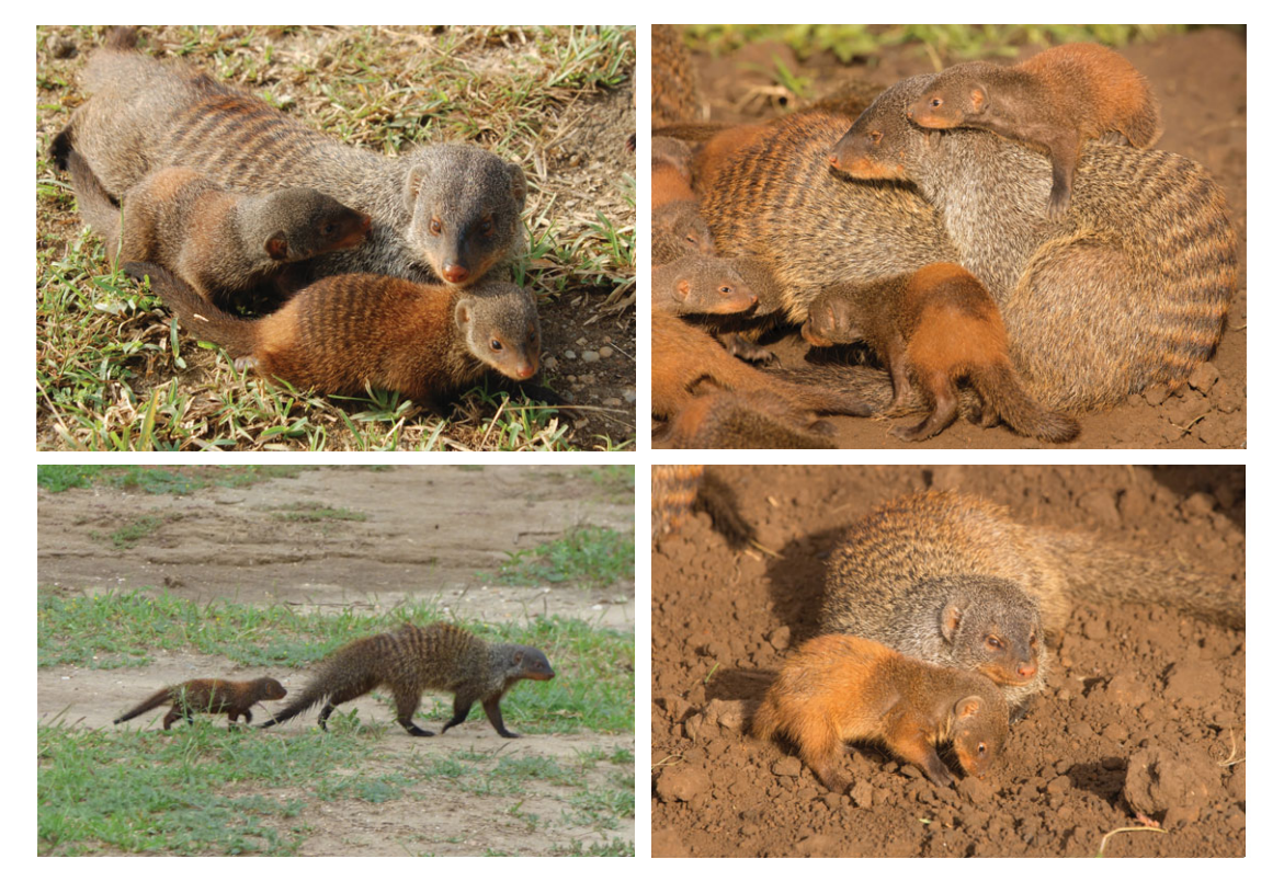
Figure 1. Escorts care for the pups carrying, feeding and grooming them.

data and set of predictor variables included in each analysis, see details below and electronic supplementary material, tables S1–S3.