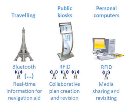
Figure 1. Overview of the Mementos system.

The Mementos system was designed to address these concerns and bring the benefits of tangible interfaces – the physicality, the seamless integration with the environment, the support for memory, epistemic action and collaboration – to the domain of tourism and travel. By doing so, Mementos not only offers a novel vision of how digital technology can support travel, but also provides a practical exploration of the main focus on this paper: how tangible interfaces, and token-based systems in particular, can be designed to support complex real world application domains involving multiple contexts and use scenarios.